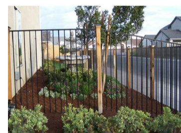
New railings between parking areas of plots 20A, 20B and 20C