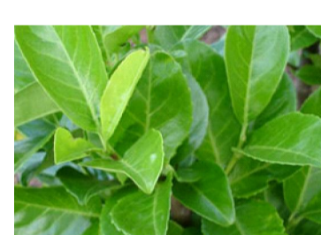
New hedging to the front and rear of all property boundaries with Laurel hedging