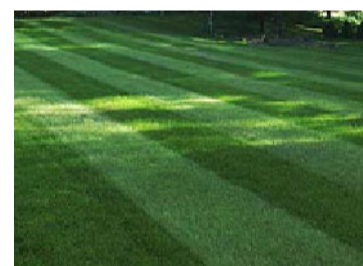
New turf to the rear and front planters for all plots