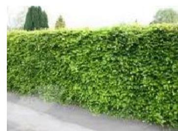
New and existing hedging between no.20 & no.18 to remain with additions of small Beech hedging