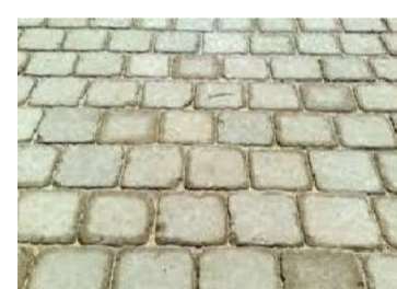
New permeable block paving to each new plot around property structure