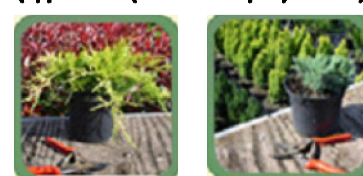
Juniperus Media old gold