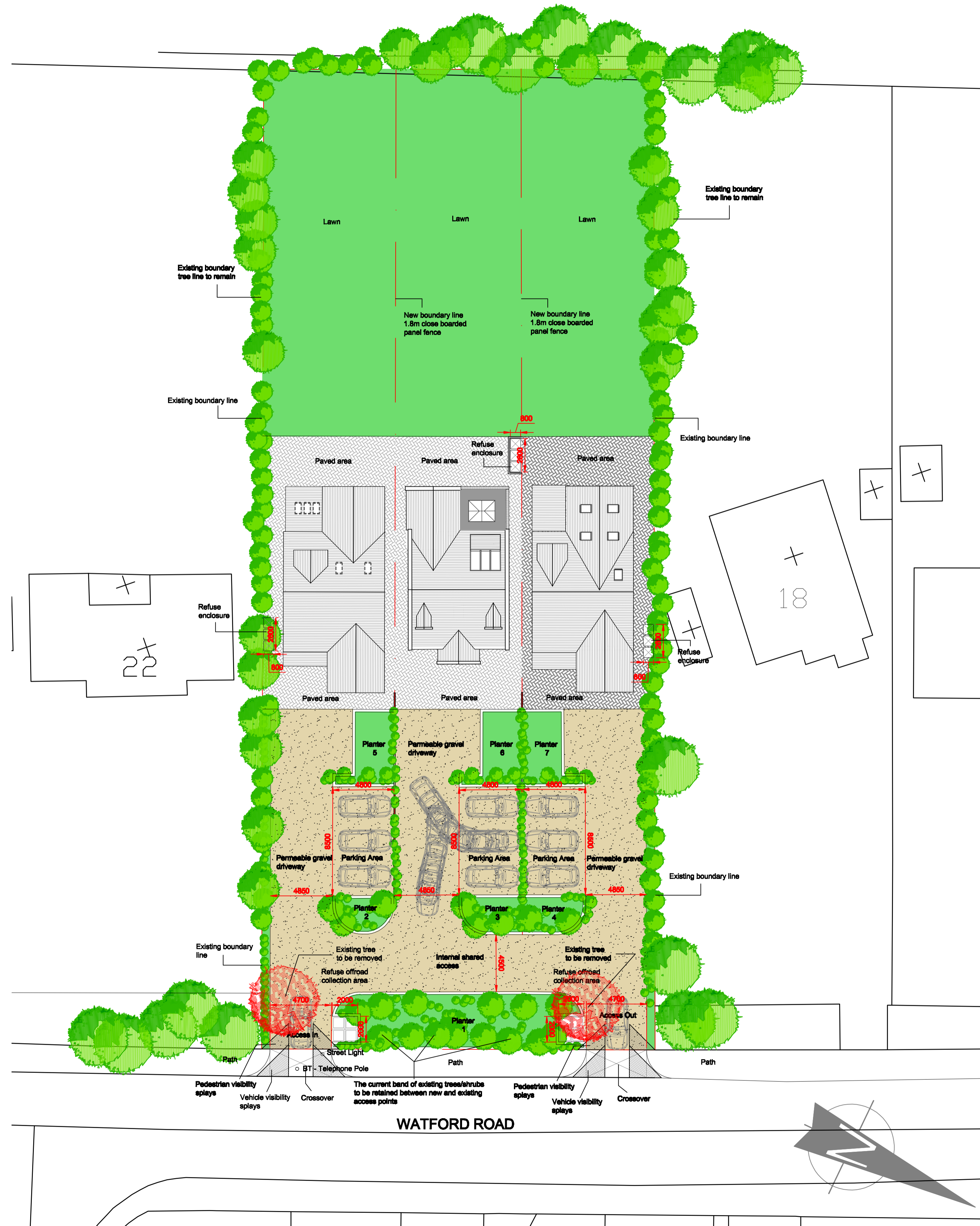
PROPOSED SITE LAYOUT PLAN 1:200